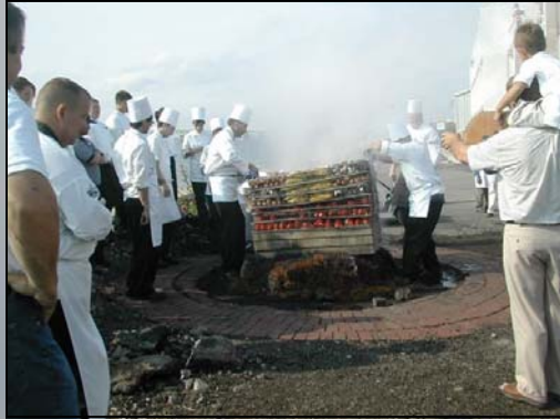
Hot off the fire!!