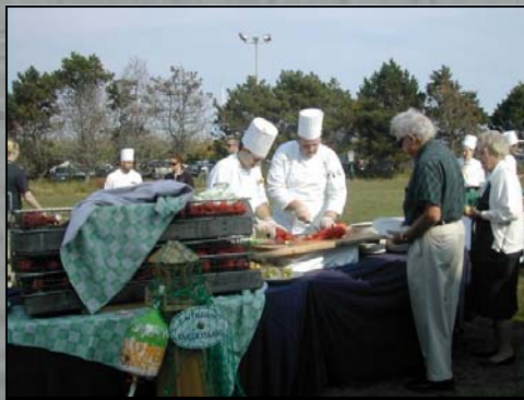
Lobster splitting on the buffet