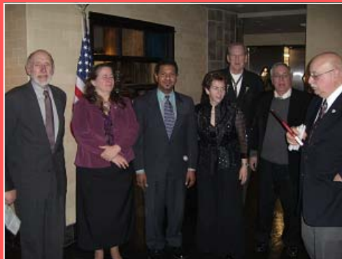
2009/10 ACFRI Officers