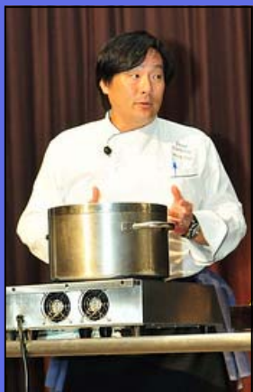
Ming Tsai preparing Peking Duck